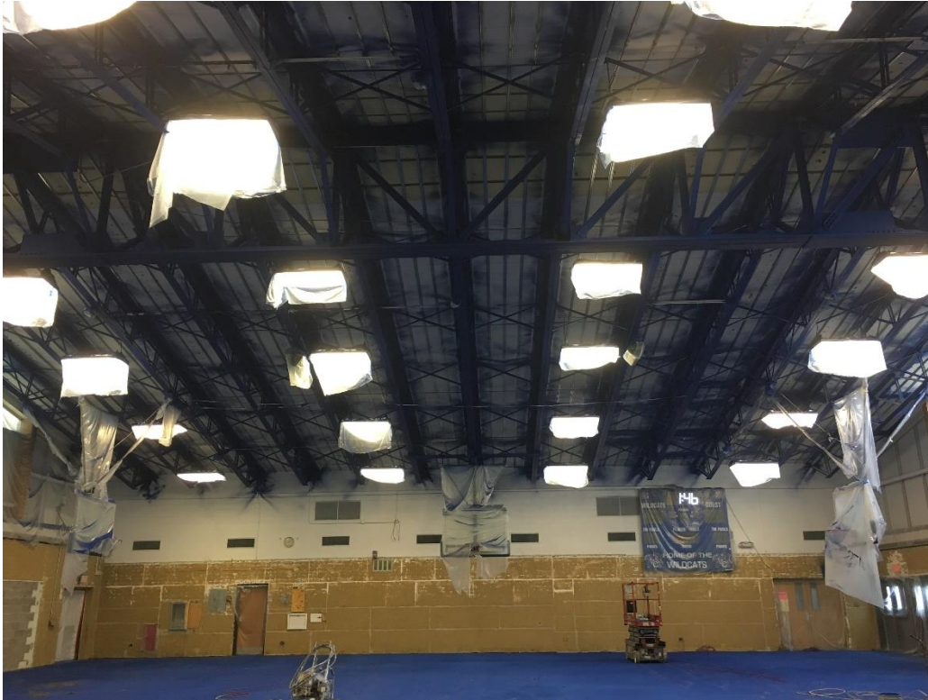
TJ Connor Elementary Gym